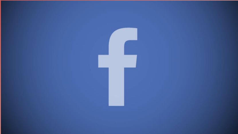
Facebook ~ Helena High Counseling