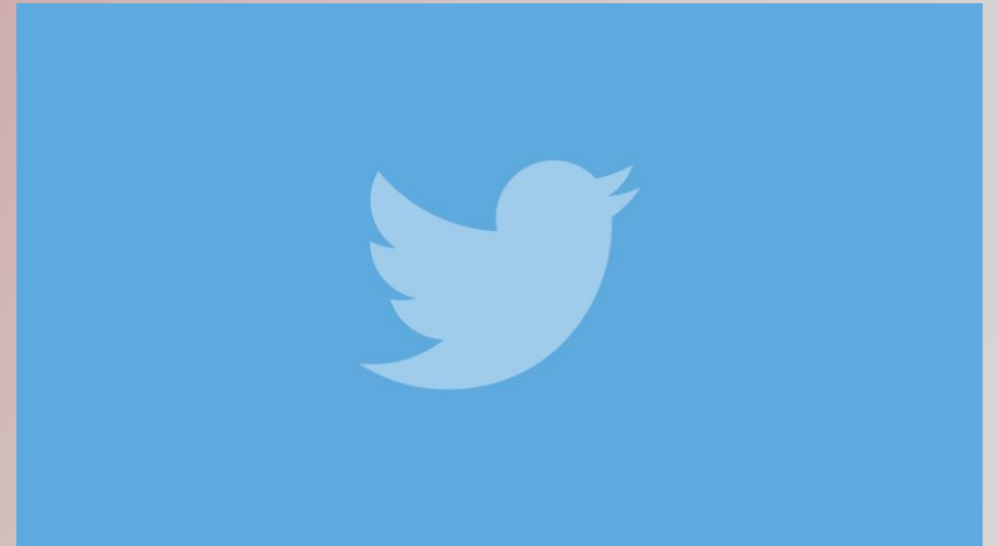
Twitter ~ Helena High Counseling